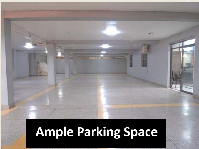
Ample Parking Space