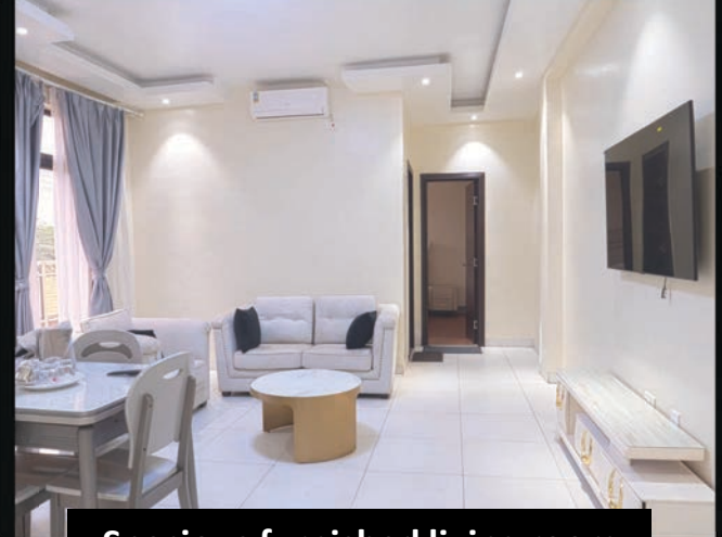
Spacious furnished living room