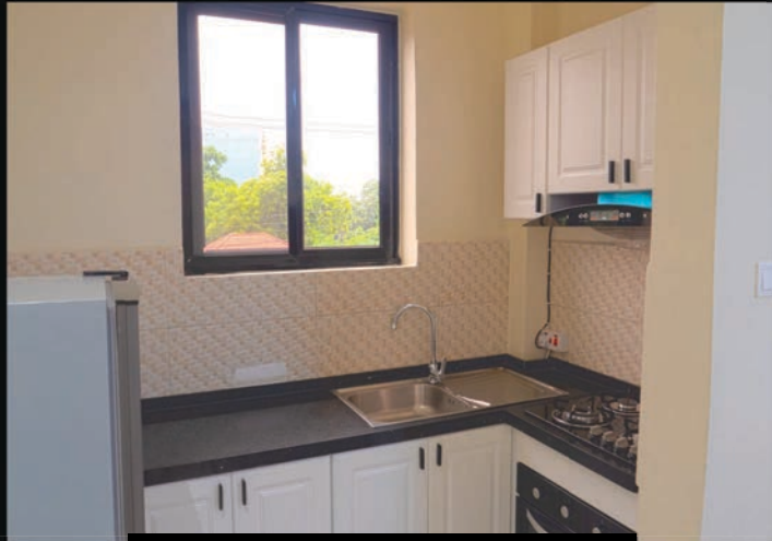
Fully Furnished Kitchenette